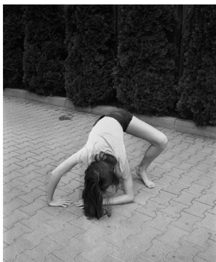
Joanna Piotrowska, Ser. of 8 photographs from Shelters and Self-Defense series , 2015 and 2017 Gift of the Amis du Centre Pompidou, IC-Central Europe, 2021

*90% of your donation is dedicated to finance the purchase of artworks and 10% of your donation covers the administrative costs of the Amis du Centre Pompidou.