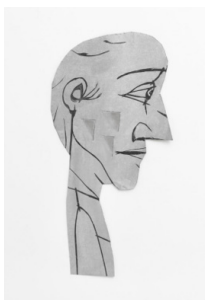
Florin Miriu, 9 8 994, 1994 Tempera on canvas, 62 x 47 cm Untitled, 1997 Zinc sheet, 110 x 50 cm Gifts of the Annis du Centre Pompidou, IC Central Europe, 2023