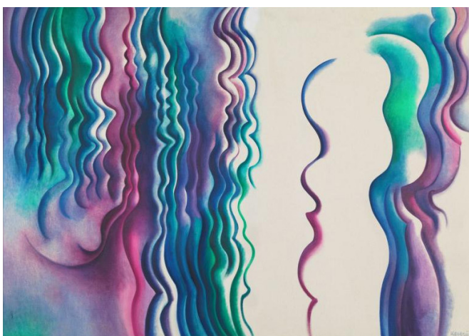
Ilona Keserü, Reconstruction , 1990 Gift of the Amis du Centre Pompidou, IC-Central Europe, 2020

Thanks to the IC-Central Europe, more than 40 works and representation from 7 countries, including Hungary, Poland and Romania are now part of the national collections.