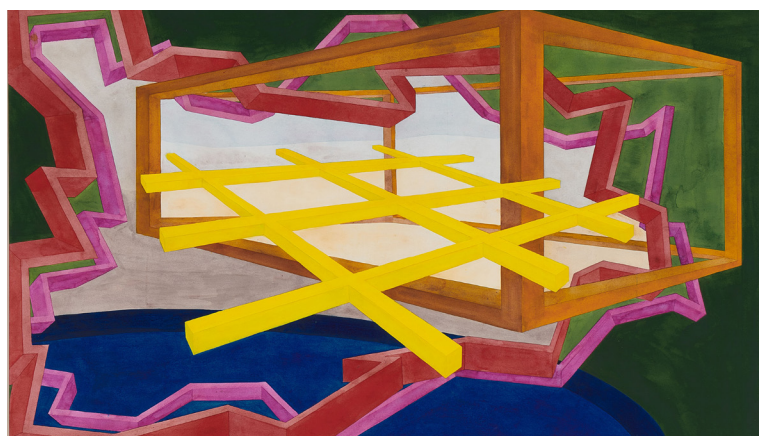
Al Held, Particular Paradox #7 , 2000 Gift of the Amis du Centre Pompidou, IC-North America, 2024