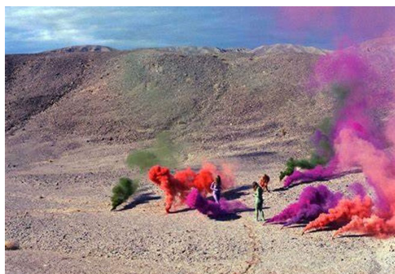
Judy Chicago, Women in Smoke , California, 1971-1972, 1971-1972 Courtesy of Jessica Silverman Gallery, San Francisco Gift of the Amis du Centre Pompidou, IC-North America, 2021

to major art world events and encounters as well as exclusive artistic content, alongside a community of committed patrons.