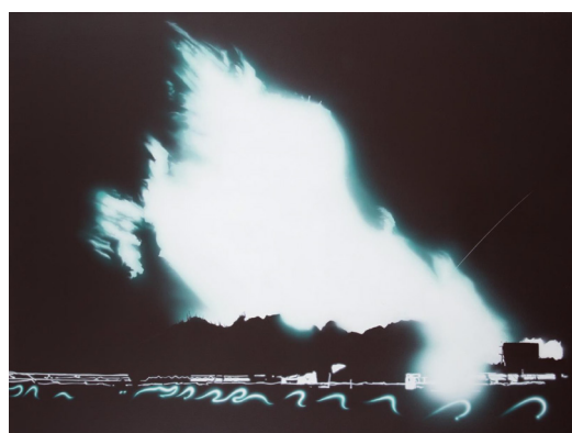
Jack Goldstein, Sans-titre , 1983 Gift of the Amis du Centre Pompidou, IC-North America, 2024