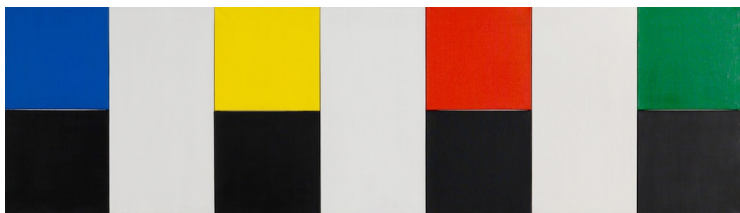
Ellsworth Kelly, Kite II, 1952

*Benefits conditional to the sanitary context