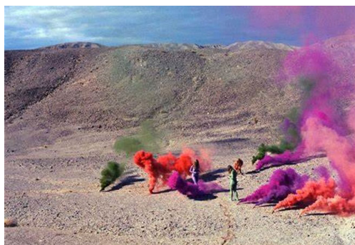
Judy Chicago, Women in Smoke, California, 1971-1972, 1971-1972. Film H. 264, MP4, color, silent, 15'13". Edition 4/20 + 2AP Gift of the Ains du Centre Pompidou, IC-North America, 2021