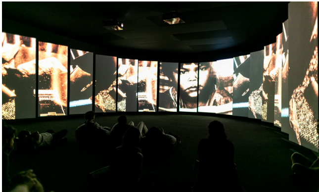
Claudio Andujar, Genocídio do Yomamami monte do Brasil, 1989 – 2018 Installation with 4 channels and 16 projections screens 24 (23h images). Edition 1/6 + 2 AP

Curator and researcher in contemporary art, Miyada curated the group exhibitions: A parte que não te pertence , Wiesbaden, Germany (Kunsthaus Wiesbaden, 2014), Se o Paraíso Fosse Assim tão Bom (Fundação Iberê Camargo, 2019), among others. Paulo Miyada was also the assistant curator of the 34th São Paulo Biennial in 2020.